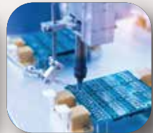
Electronics & Assembly Industries