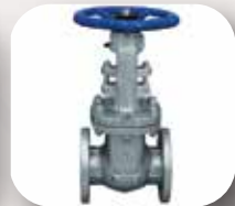
Valve & Assembly Manufacturers