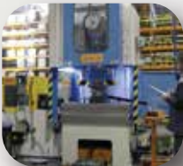
Press Components & Sheet Metal Industries

Machine History Critical Spares Tool History and Tool life monitoring Calibration Chart Breakdown History MTBF and MTTR Idle Time Analysis