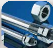
Fasteners & Cold Forging Industries