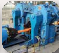
Forging & Machining Industries