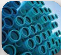
Injection & Rubber Molding Industries