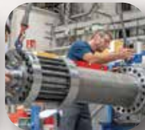
Casting & Machining Industries